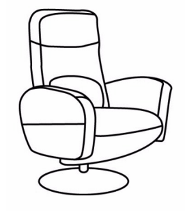
1RPO2 base 1 81 / 90 (168) / h 109