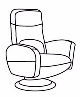
1RPO2 base 3 81 / 90 (168) / h 109